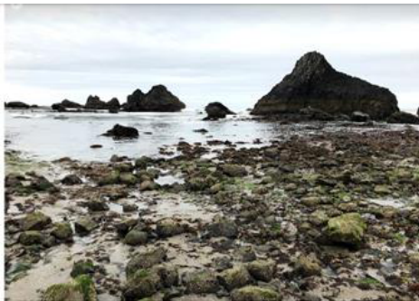
Low Tide at Seal Rock, OR

Any place between the North Pole and the Equator, and from the Pacific to the Atlantic is within reach. Fact is, we may have visited there a time or two!