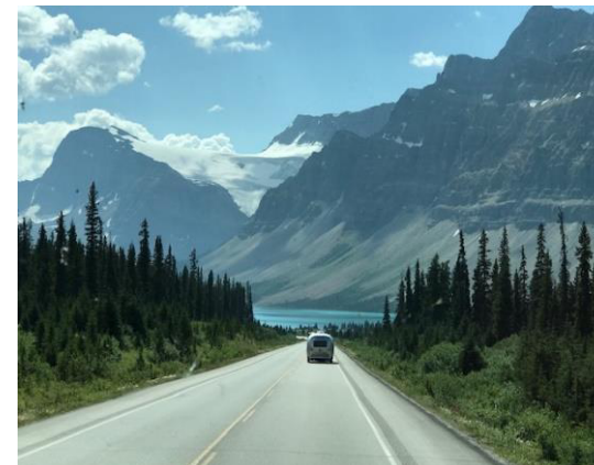
Canadian Rockies Near Banff, AB, CA