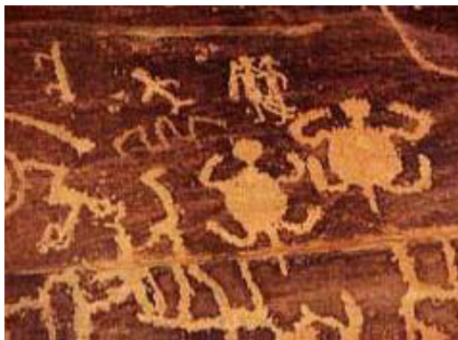
V-V Heritage Site Near Sedona, AZ

Come to a Caravan Meeting to see what we have planned.