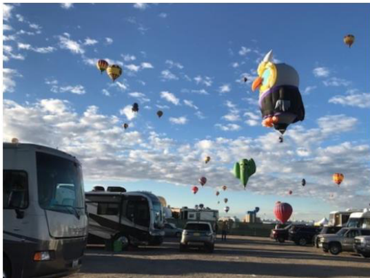
Albuquerque Balloon Fiesta