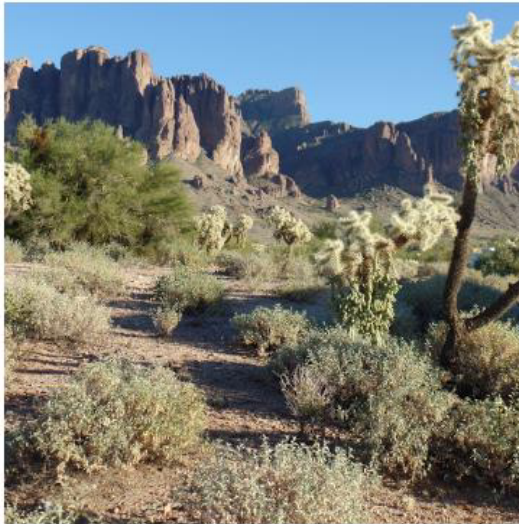
Lost Dutchman State Park AZ

We invite all residents of Sun City West with a current Recreation Centers activities card to visit and join our RV Club. Dues are only $10 per person per year and anyone joining on or after October 1st is considered a paid-up member for the following calendar year. Club name badges are provided by our club for an at-cost fee.